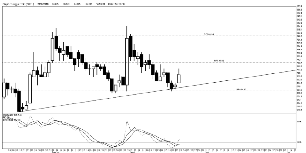
Kinerja harian GJTL