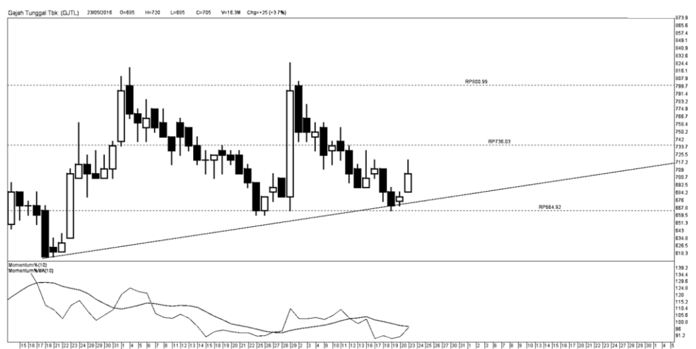
Kinerja harian saham GJTL